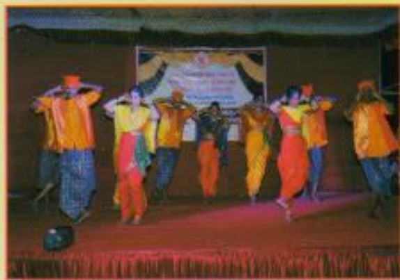
Cultural Programme Perform by College Students