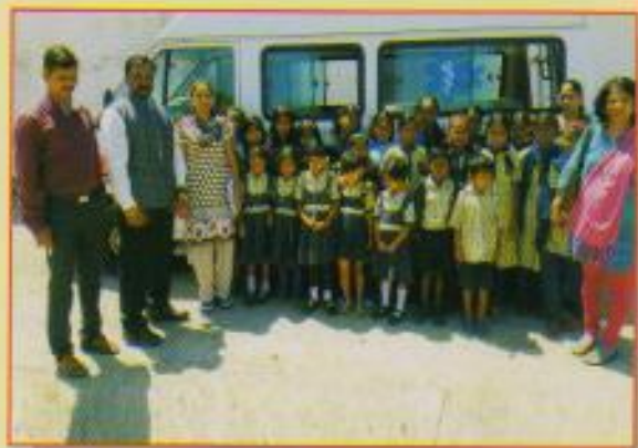
PMC School Childrens Brought in Ambulance at ACT Hospital for Specialized Services by Team of ACT & PMC School Staff