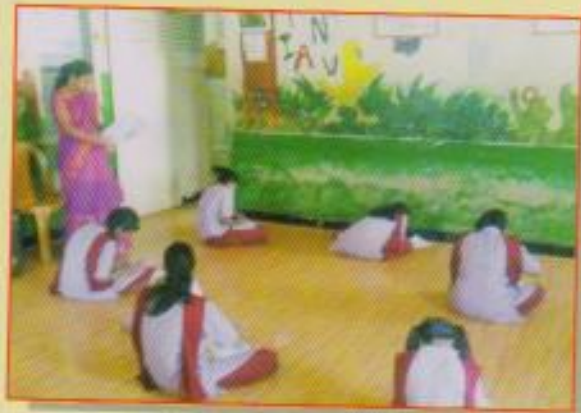
Special Educator teach to Hearing Impaired Students