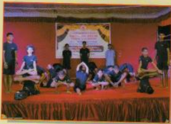
Cultural Programme Perform by Residential Deaf School Childrens