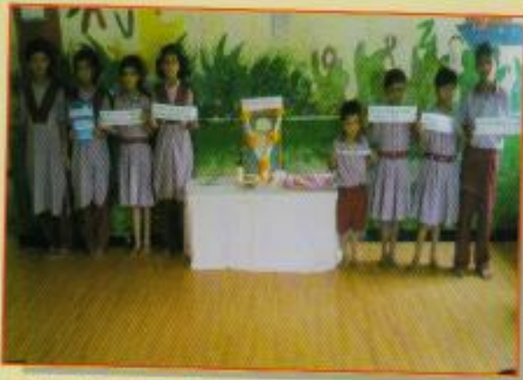
School Children Celebrating DR. Ambedkar Jayanti Programme