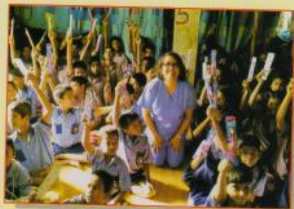
Guests / Donors Entertainment with Hearing Impaired Children