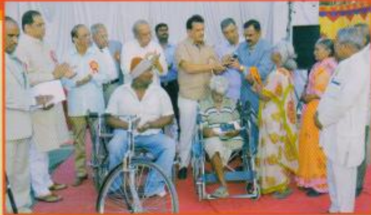
Hon. Shri. Dattatray Dhankawde - Mayor Pune & other Dignitaries giving Aids / Appliances to PWD