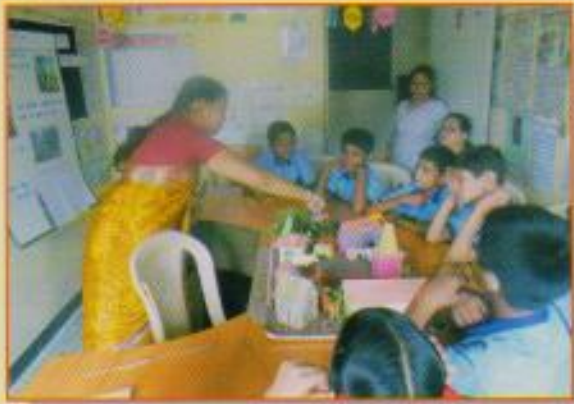
Demonstration Lesson Observe by our D.Ed / B.Ed Students