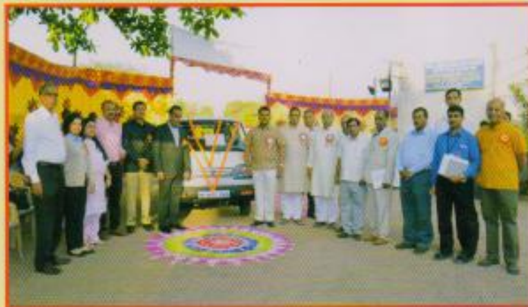
UPS Foundation Atlanta Donated Maruti Omni Van to Our Deaf School