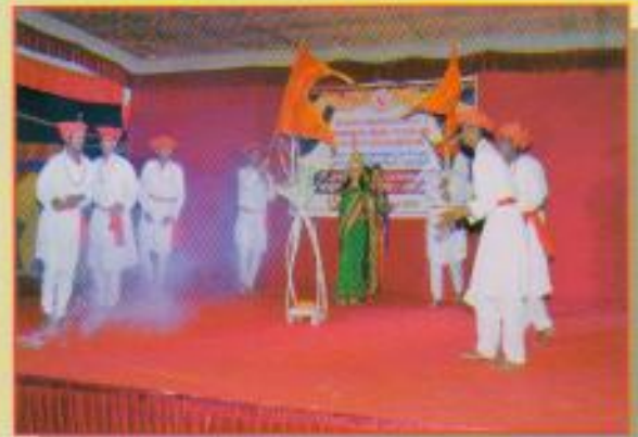
Cultural Programme Perform by College Students