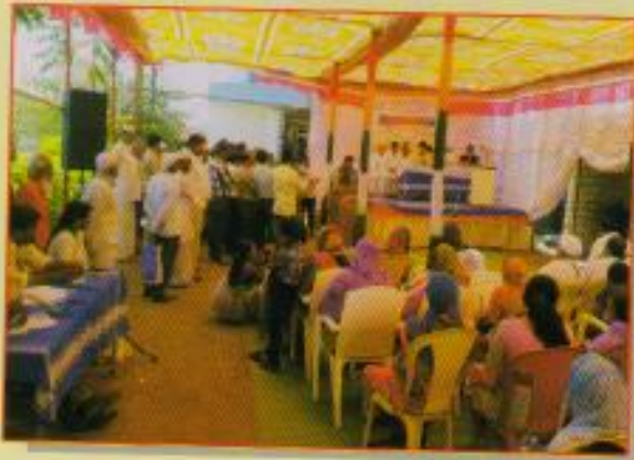
Patients / PWD attend the Disability Detection Camp