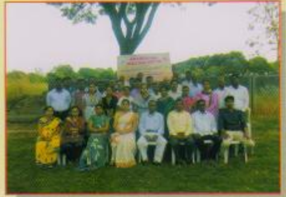
Group Photograph of CRE Programme