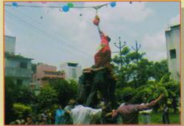
Co-Curriculum activities by College and School Students